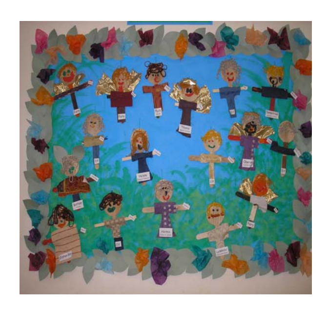
Class 1 "A Midsummer Night's Dream"

As part of our work with the RSC, over the last few weeks we have been looking and studying various Shakespeare plays. The children's enthusiasm for this work has been infectious and we decided to use Shakespeare as a theme for our hall displays this term. Please do pop in and have a look. The children are very proud of their work.