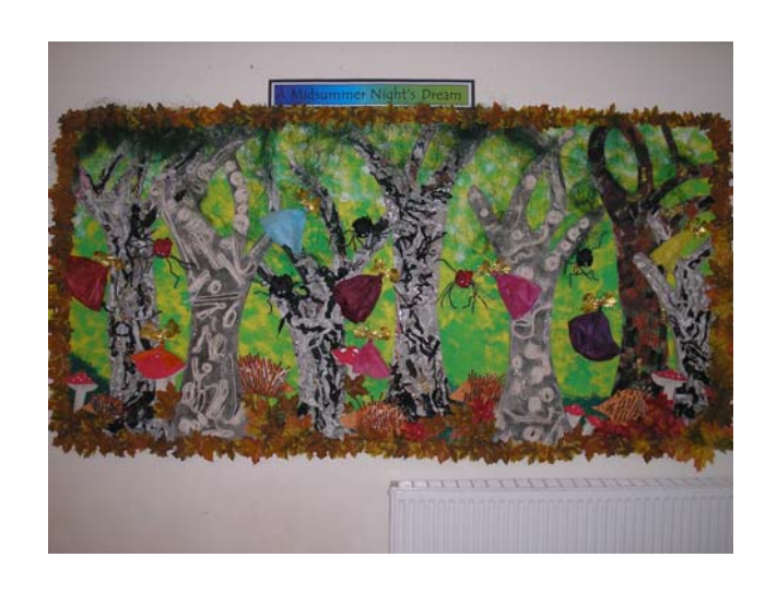
Class 2 "A Midsummer Night's Dream"