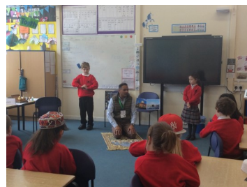
Children learning about how a Muslim prays

We tried lots of different traditional Indian snacks