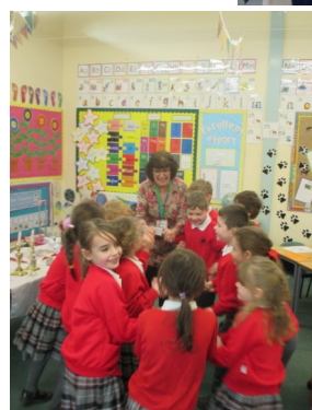
Class 2 enjoying some traditional Jewish dancing