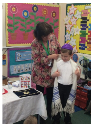
Trying on traditional Jewish Clothing